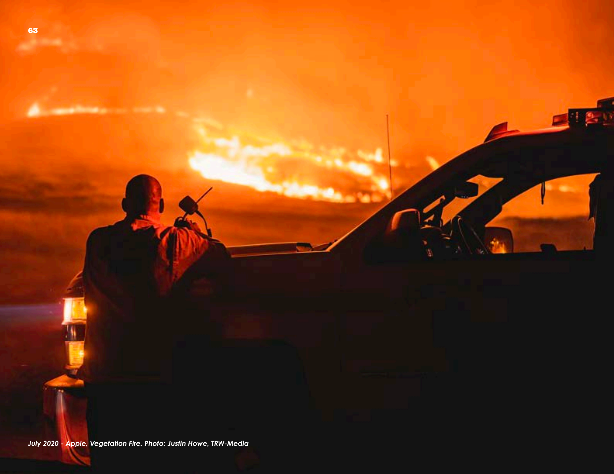
July 2020 - Apple, Vegetation Fire.