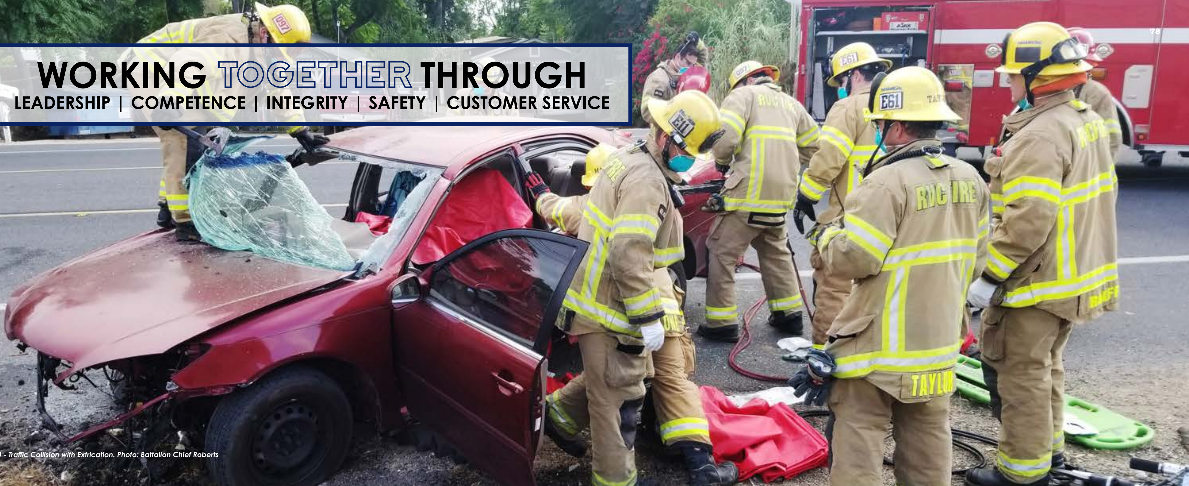
August 2020 - Traffic Collision with Extrication.