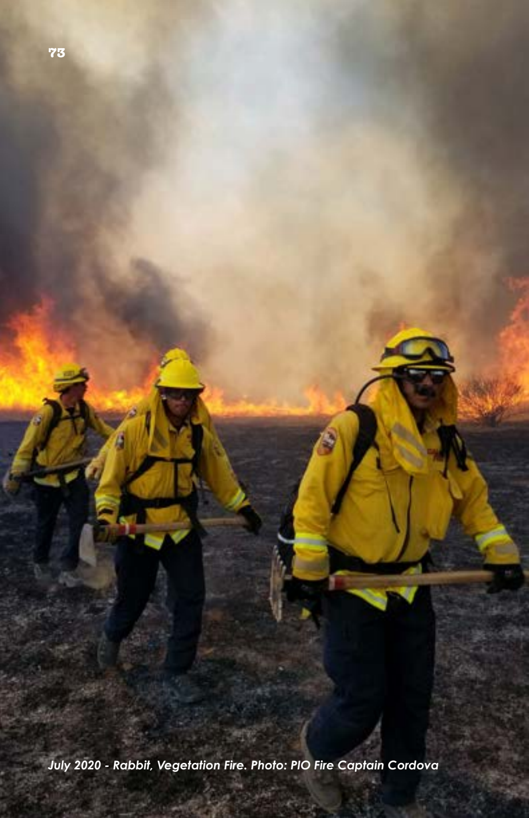
July 2020 - Rabbit, Vegetation Fire.