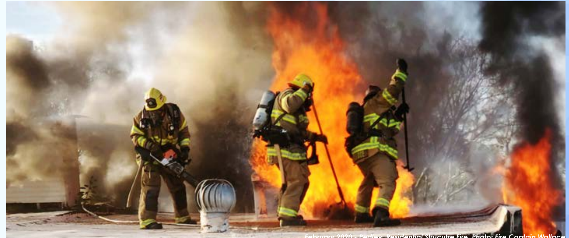
February 2020 - Pedley, Residential Structure Fire.