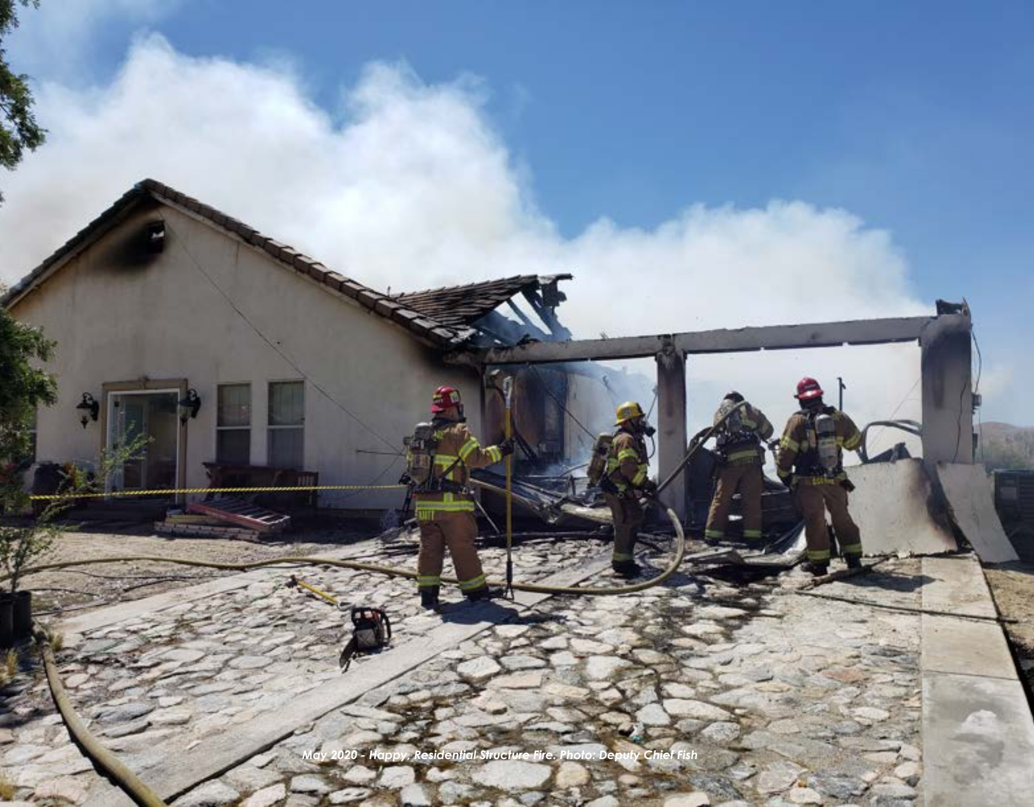
May 2020 - Happy, Residential Structure Fire.