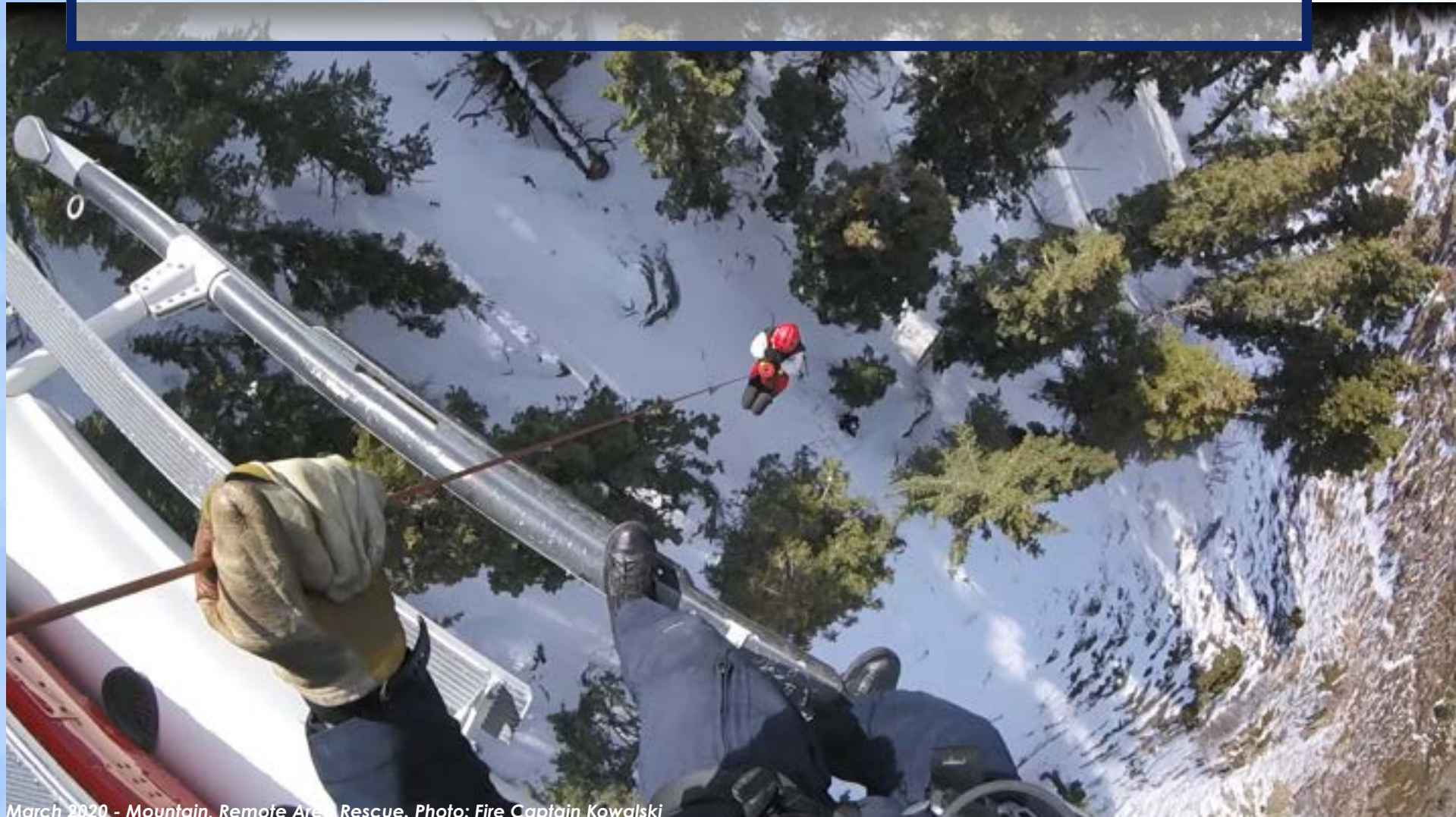
March 2020 - Mountain, Remote Area Rescue.