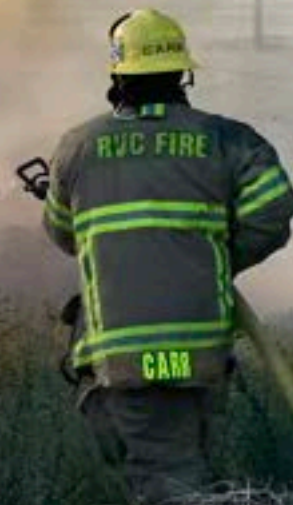
May 2020 - Gilman, Commercial Vehicle Fire into the Vegetation.