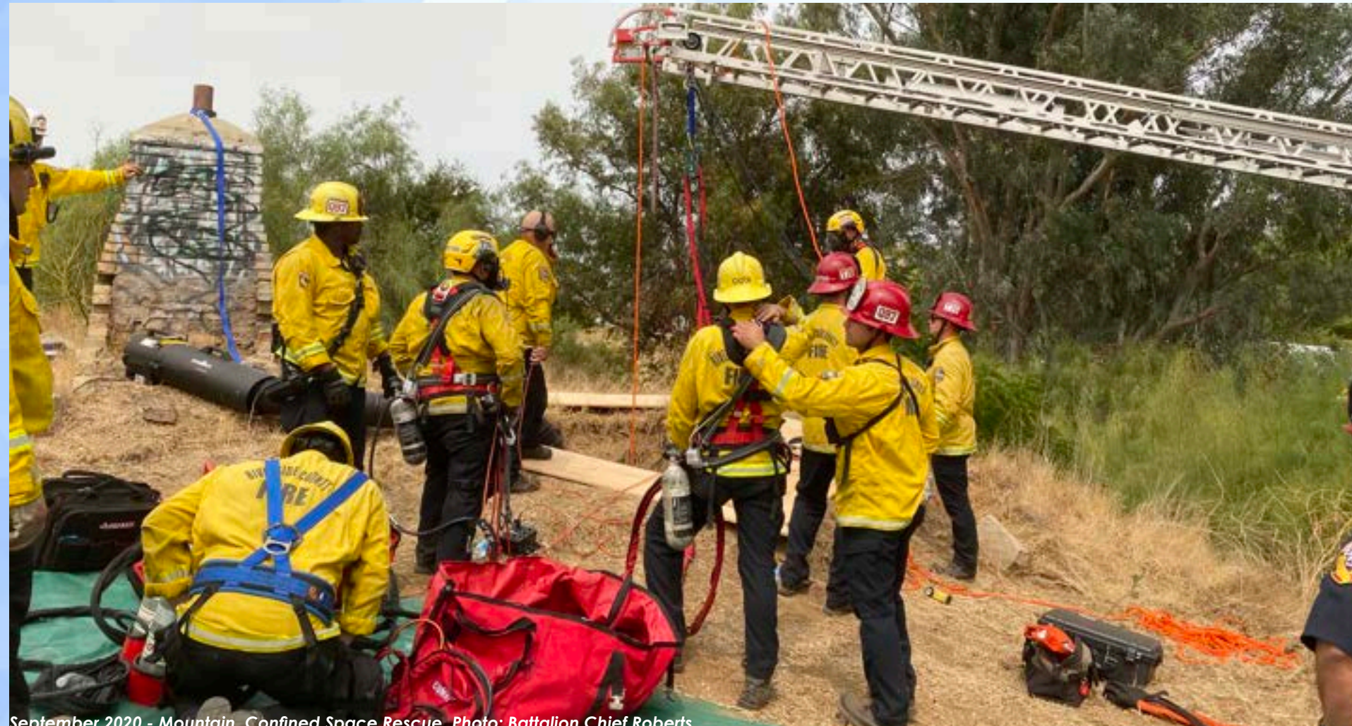
September 2020 - Mountain, Confined Space Rescue.