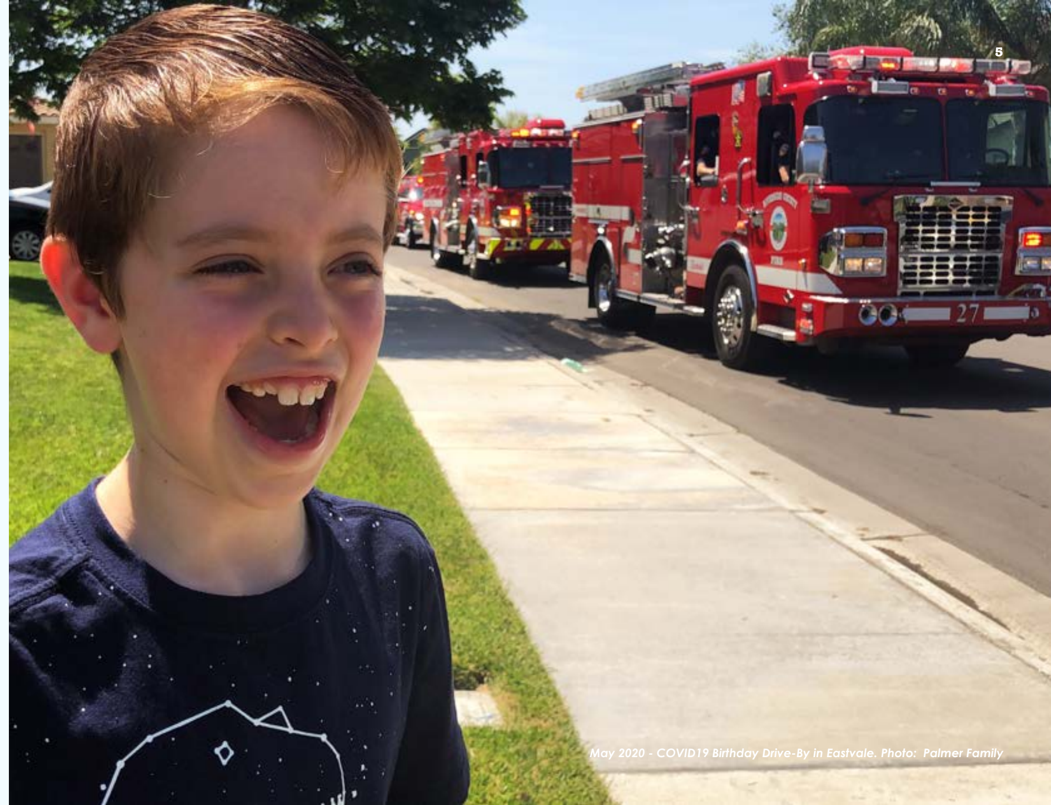
May 2020 - COVID19 Birthday Drive-By in Eastvale.