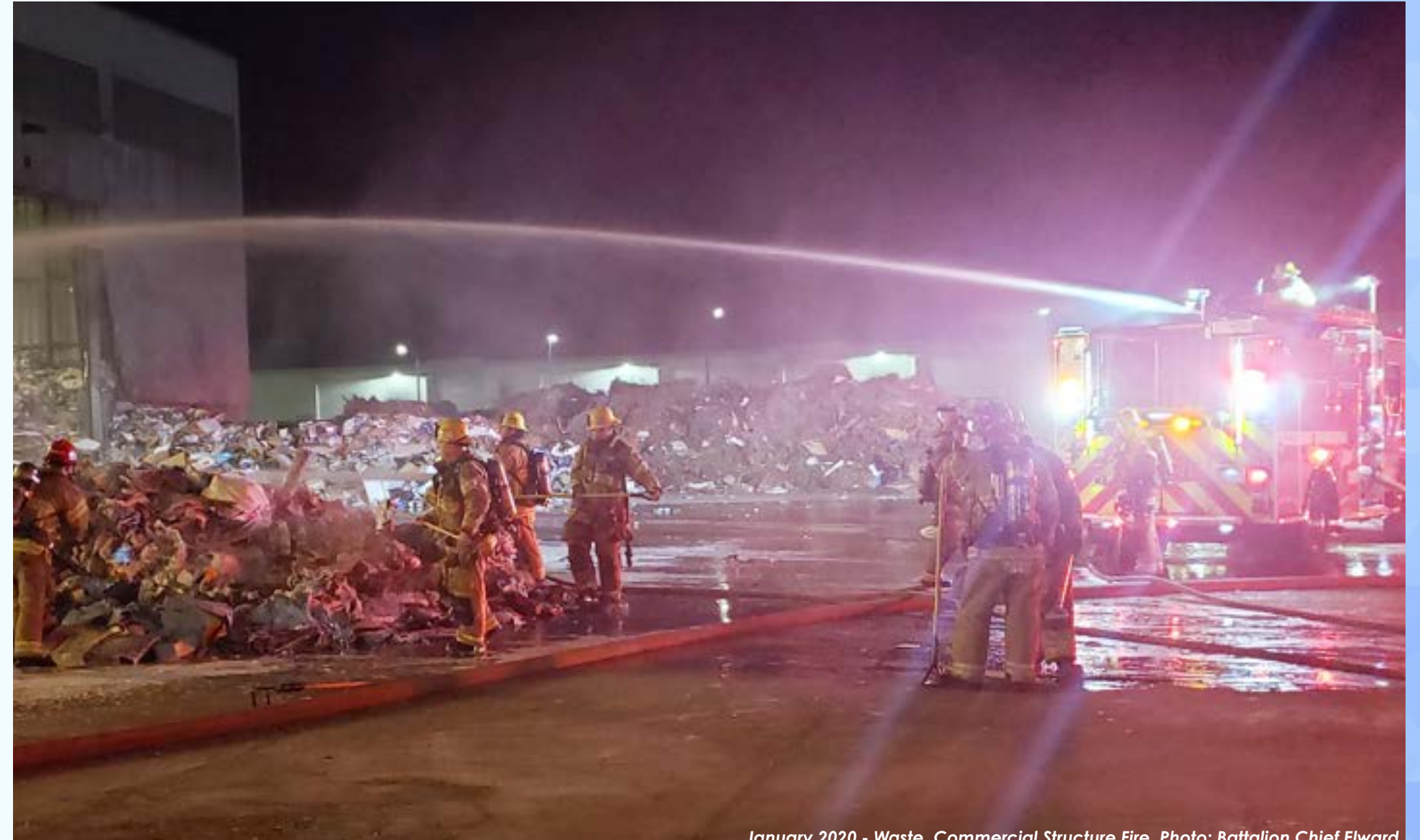
January 2020 - Waste, Commercial Structure Fire.