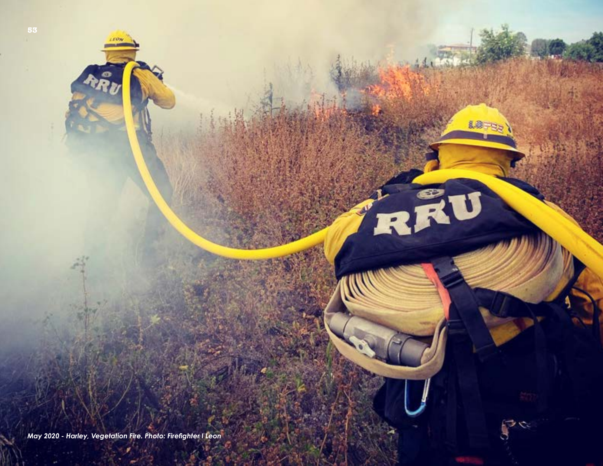
May 2020 - Harley, Vegetation Fire.