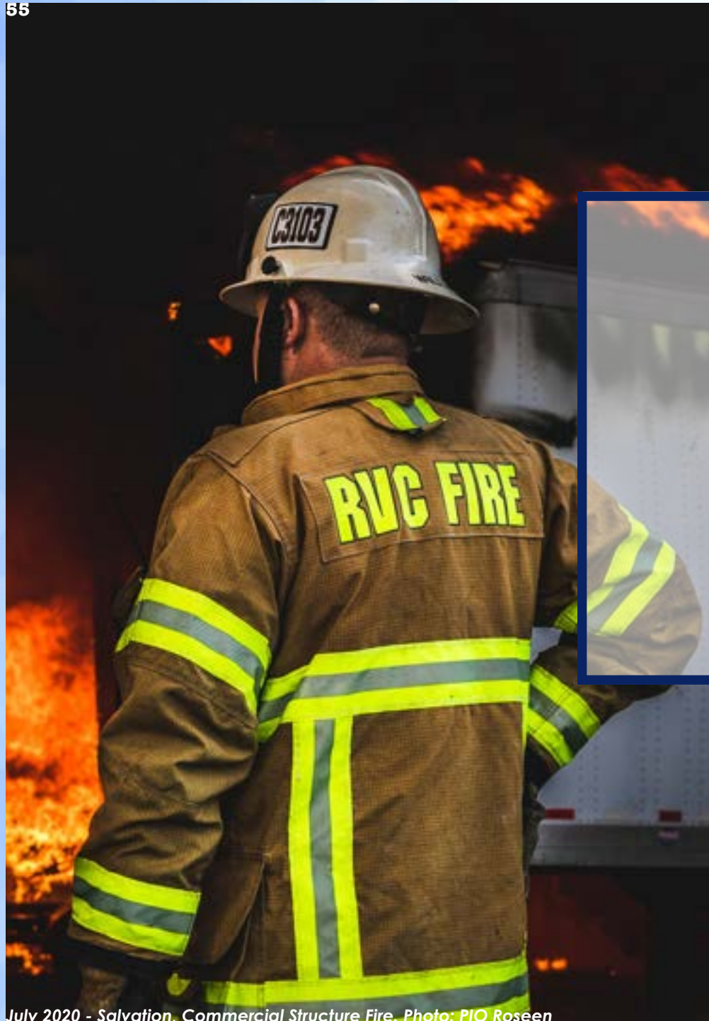
July 2020 - Salvation, Commercial Structure Fire.