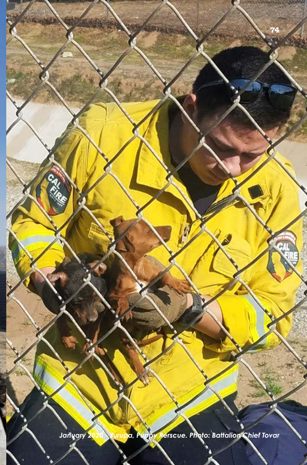
January 2020 - Turupa, Puppy Rescue.